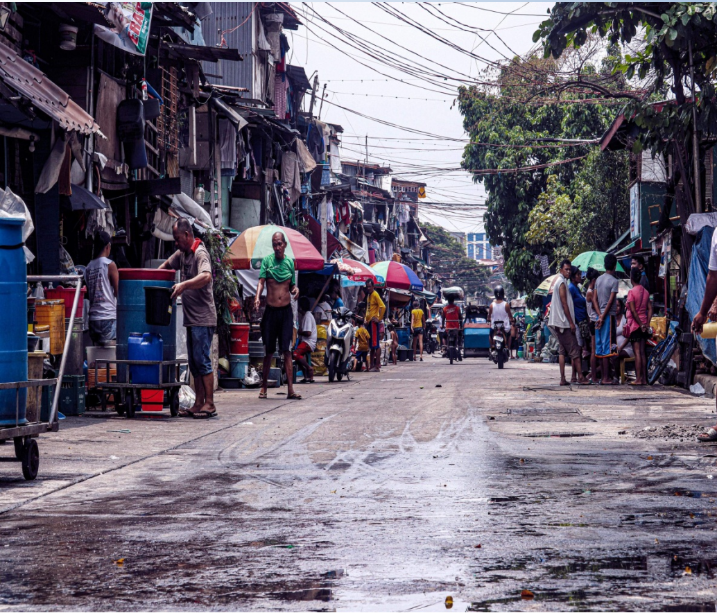
MUELLE DE BINONDO